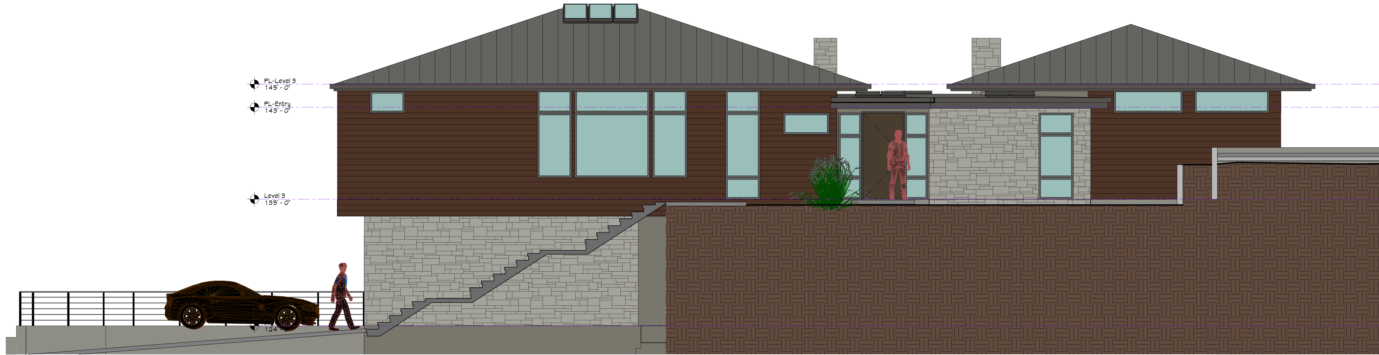
1 Elevation East 1/4" = 1'-0"